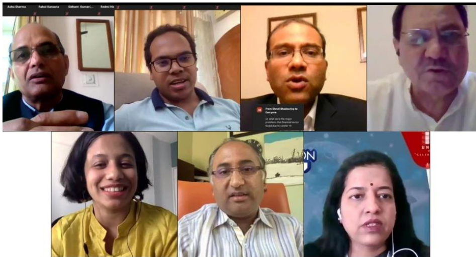
Fig. Experts During the Inaugural Session of 9 th Innovation Summit

The 9th Innovation Summit 2021, organized by the ITM School of Management at ITM University, Gwalior, was held on February 25-26, 2021. The summit focused on the theme “Opportunities and Challenges for Business due to COVID-19,” addressing the critical impacts of the pandemic on various industries. The event brought together a diverse group of distinguished speakers, industry professionals, faculty, and students, providing a platform for exploring innovative solutions and strategies in the context of the current global crisis.